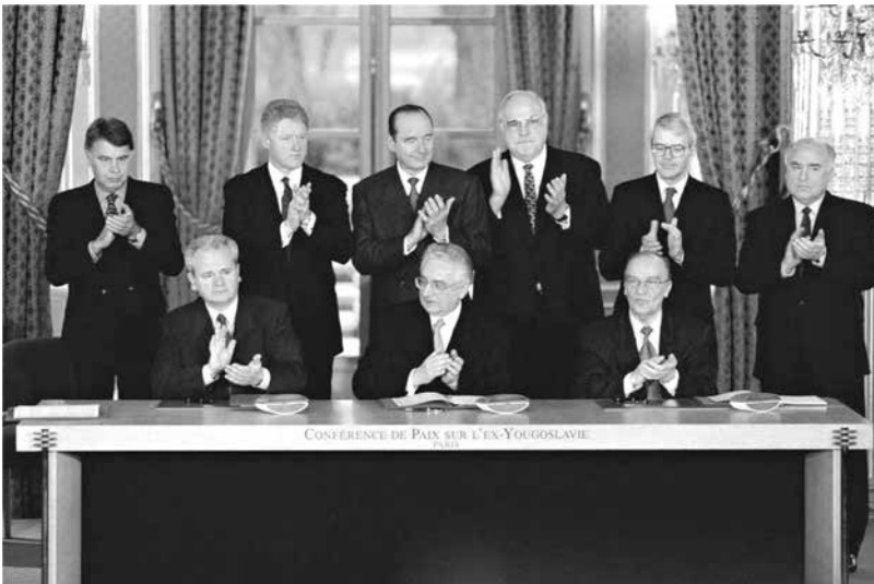
Signing of the Dayton Peace Accord, 14 December 1995, Paris

Perhaps we can allow that at the signing of the Accord, the world leaders overseeing its creation did not have a full picture of the atrocities and the devastation this country has suffered: the horrifying number of mass graves on RS territory, the Srebrenica genocide. Dayton was never meant to cement the future of this country but pave the way for it. However, with what we know today, expecting Bosnians to come together and reform a constitutional framework that cannot be reformed considering the stakeholders involved, and the decision-making process required, is disingenuous at best. Ultimately, the same political forces that brought about the original Dayton constitution must be involved in its transformation. This means the international community must again provide the impetus, if we must provide the muscle.